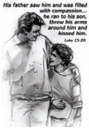
His father saw him and was filled with compassion... he ran to his son, threw his arms around him and kissed him. Luke 15:20

God our Father, in your wisdom & love you made all things. Bless our fathers, that they may be strengthened as Christian Fathers, let the example of their faith & love shine forth, grant that we, their sons & daughters, may honor